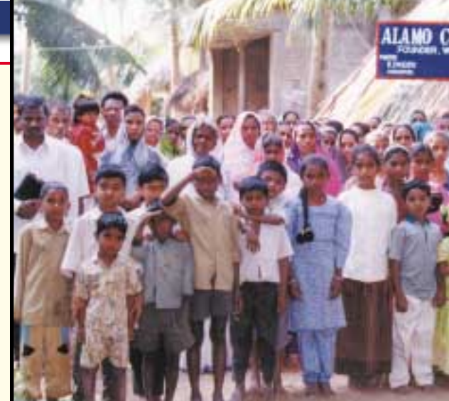
Alamo Ministries congregation at Rakurthivari Palem, wi

Thank you for your kind post parcel, and the newsletter. We are extremely happy to see your helping wings are spread almost all over the world. We sincerely thank God for using you as a wonderful instrument in His vineyard. May we in this juncture request you to give us a hundred men to work for Christ so that many more perishing souls will have a