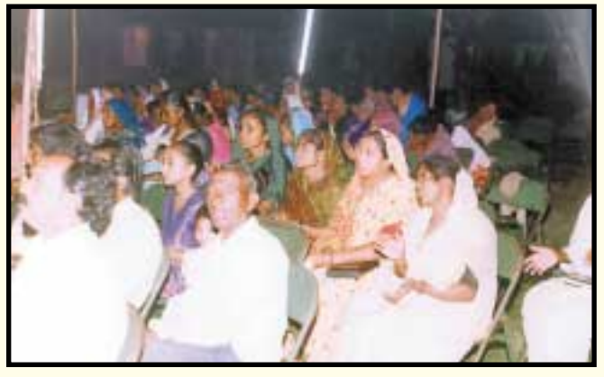
Alamo Christian Ministries congregation praising the Lord in song.