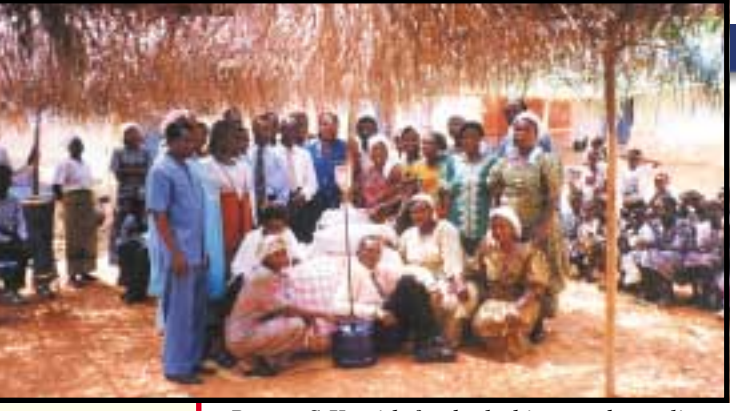
Pastor S.K. with food, clothing, and supplies to distribute to the villagers. Accra, Ghana