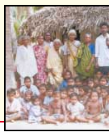
Group photo of the orphans Maruteru, India