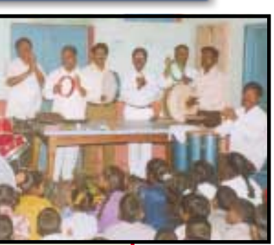
tors singing the Lord. Rev. aram, India