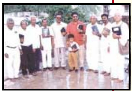
Pastors of Harvest Ministries