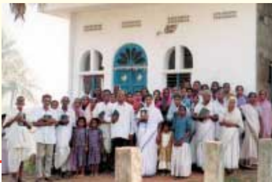
Alamo Christian Ministries' congregation—Amalapuram, India

We are confident that this ministry has a bright future to establish itself as one of the best ministries in India.