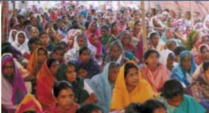
Women gathered at a meeting of Alamo Christian Ministries—India.