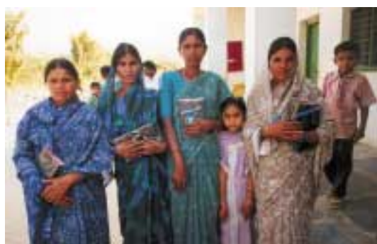
Bible women at Pastors' Conference—Amalapuram, India