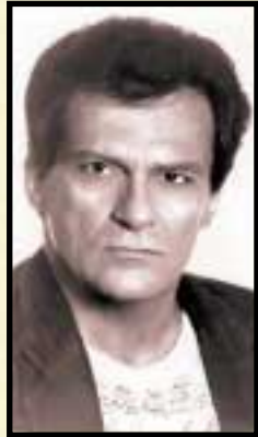
Pastor Tony Alamo

God gave Adam the authority to rule the world for Him, according to His purpose. God's purpose since the beginning of time has been to spiritually create a nation of people made out of dirt, who would prove to the universe their loyalty and obedience to God by allowing themselves to be united with God by the Spirit of the entire Triune God. 3 They are the exact opposite of Lucifer. Lucifer left his