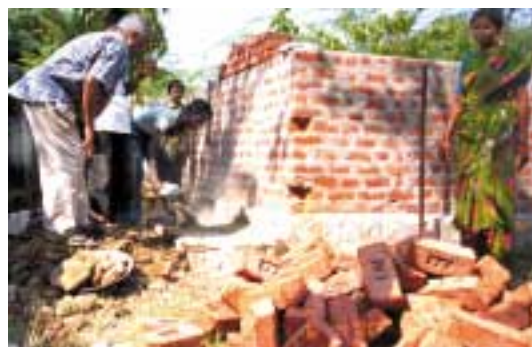
Brother J.E. watches construction of a new baptismal pool.