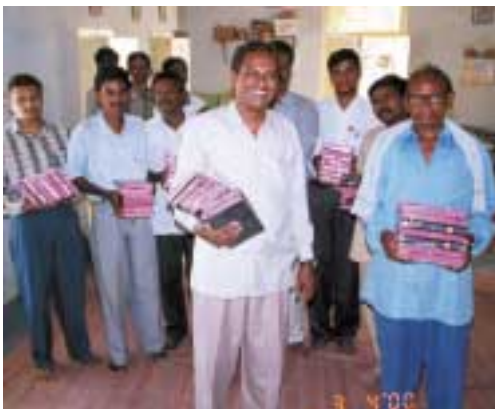
Alamo Christian Ministries' associate pastors preparing to distribute free Bibles.