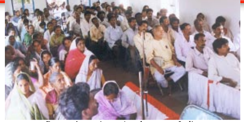
Pastors' meeting – Amalapuram, India