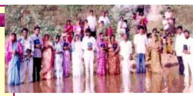
Alamo Christian Ministries baptism of new converts at a village near Hyderabad, India.