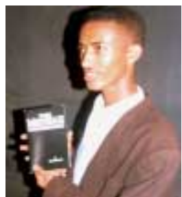
Distributor, Z.B. with Messiah book.–Dangila Town, Ethiopia