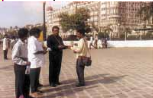
In front of the Taj Hotel