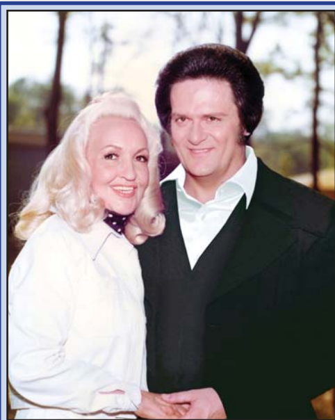
Pastor Tony Alamo with his late wife Susan Photo—1980

Hardly any born of the Spirit Christians are living a Christian kingdom community life on earth where everyone has everything in common, which is the community life we see in the book of Acts or The Acts of the Holy Spirit (Acts 2:42-