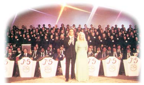
ALAMO MINISTRIES ONLINE www.alamoministries.com