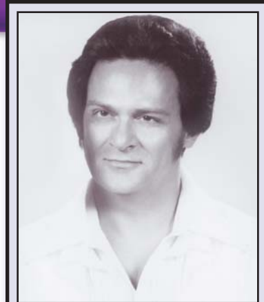
Pastor Tony Alamo