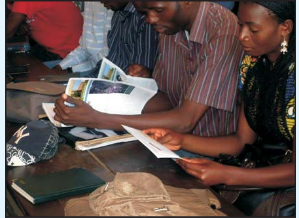
Studying Pastor Alamo's literature in French—Democratic Republic of the Congo