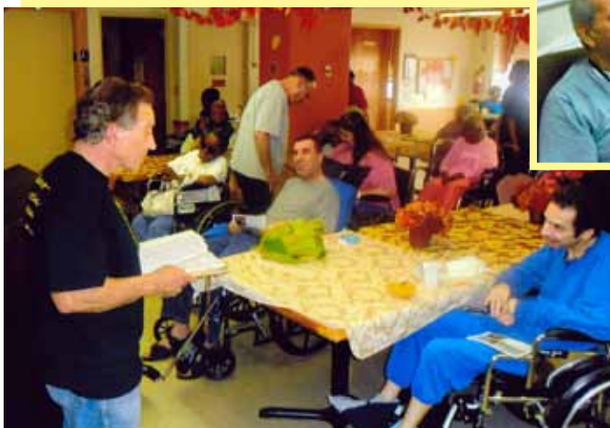
Brothers and sisters of the Alamo Ministry ministering to the elderly residents in nursing homes