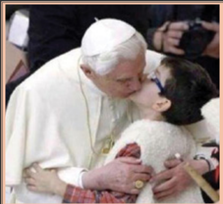
Former Pope Joseph Ratzinger kissing a young parishioner