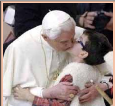
Former Pope Joseph Ratzinger kissing a young parishioner

Catholic Jesuit head Adolfo Panchon announced his resignation this week after the International Common Law Court of Justice in Brussels linked him to Ninth Circle Satanic Child Sacrifice Cult ceremonies. For the last month five judges have "examined