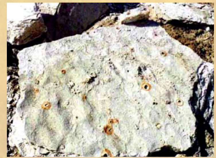
Photographs of the brimstone enclosed in the ashen remains