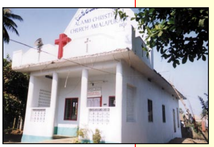
Alamo Christian Church building Amalapuram, India