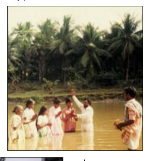
...and Oaxaca, Mexico