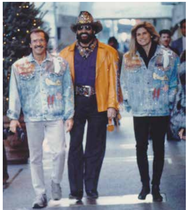
Sonny Bono, Pastor Tony Alamo, and Congresswoman Mary Bono walking in New York City

Thank you very much for your consideration. I appreciate anything that you can do to help me get out of here. I'm praying that God will get ahold of some of you people to help us with the ministry and to help us to help others. God bless you, and I'm waiting to hear from you.