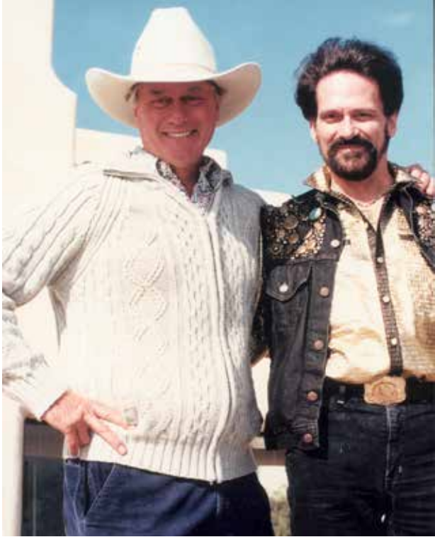
Actor Larry Hagman and Pastor Tony Alamo at Larry's home at the Colony in Malibu, CA

The reason for my incarceration is that my trial was a big rush. I was rushed into court, and the trial was rushed.