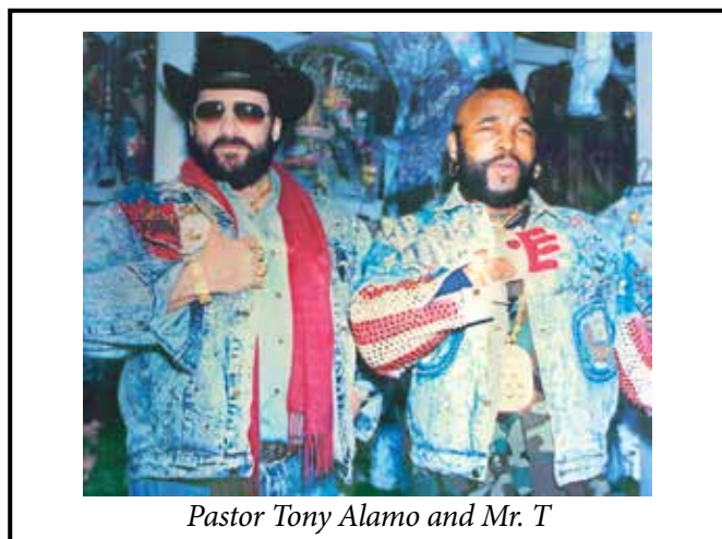
Pastor Tony Alamo and Mr. T

We worked hard to manufacture the clothing. The movie stars were wearing them. We were in Macy's in New York, Neiman Marcus stores, Merry-Go-Round, and hundreds of other stores. They went to all the stores that we were in and told them that little children did the airbrushing and rhinestoning of the jackets. That also was a filthy lie. They said that they didn't have to pay for our clothes that were in their stores, and that they were not to order them any longer. If they ever bought any of my clothing again, that they would close their stores.