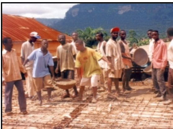
Pouring a slab foundation for worship center in Nkawkaw, Ghana, Africa.