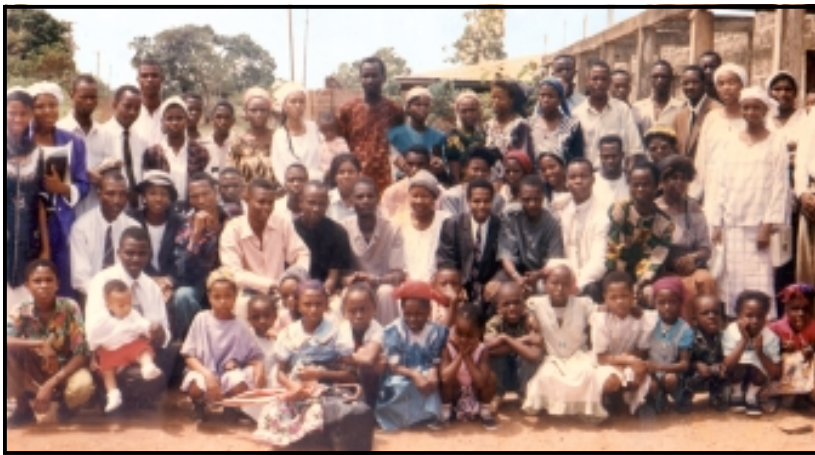
Alamo Christian Ministries congregations in: Benin City, Nigeria...

The request was immediately granted. A Bible, literature, and tapes were sent.