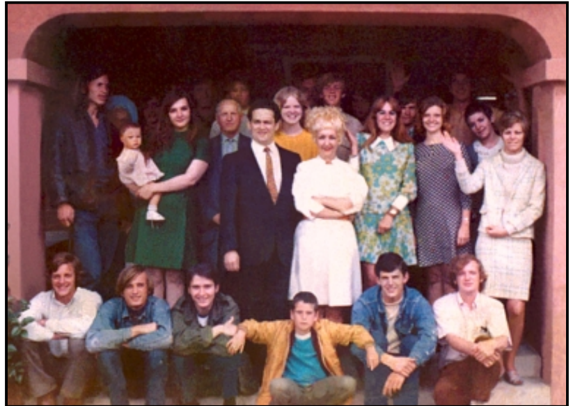
Tony and Susan Alamo with new converts in front of their first church building, a former dope den on Carlos Avenue, Hollywood, California, 1969.