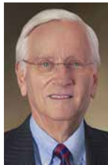
William Sessions (Head of the F.B.I.)