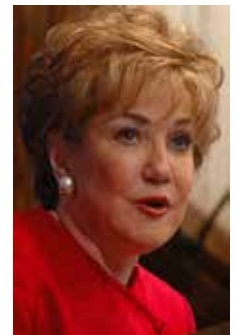
Elizabeth Dole (Head of U.S. Department of Labor)

Anyone following after the doctrines and philosophies of these people is: