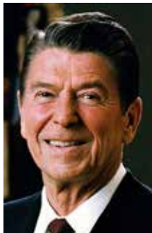
Ex-President Reagan (Promoted one-worldism and Genocide)