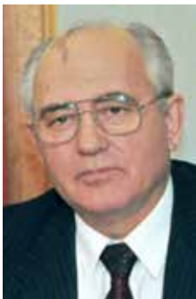
Mikhail Gorbachev (Another one- worlder preaching "Peace, Peace" for Rome)