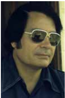
Jim Jones (Catholic cult leader)