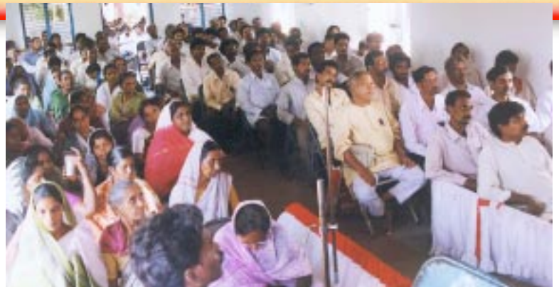
Pastors' meeting – Amalapuram, India