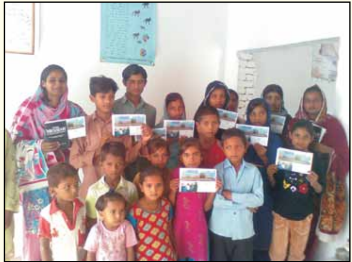
Distribution of English "Messiah" books and Urdu newsletters to children, youth, and adults in mini children's church (above) and in schoolroom (below) in Sahiwal, Pakistan